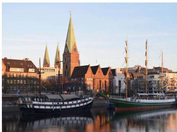
River Weser and Schlachte

The conference fee for virtual conference attendance is 15 € . Included in the virtual fee are attendance to the conference, a social program including an online excursion, as well as the proceedings for contributing authors.