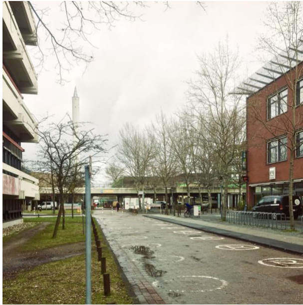
Picture 5: Enrique-Schmidt-Str. Between GW2 and SFG/Café Unique

After having parked your car, go back to Enrique-Schmidt-Str and follow the street until you pass between two buildings: GW2 is on your left and SFG/Café Unique at your right (picture 5). Behind the buildings turn left and climb up the stairs to Universitäts-Boulevard (picture 6). Turn left again to enter the GW2 building at “GW2 EINGANG/BOULEVARD” (picture 7). In GW2, take the stairs in front of you. At the top of the stairs, you will find rooms B2880 and B2890.