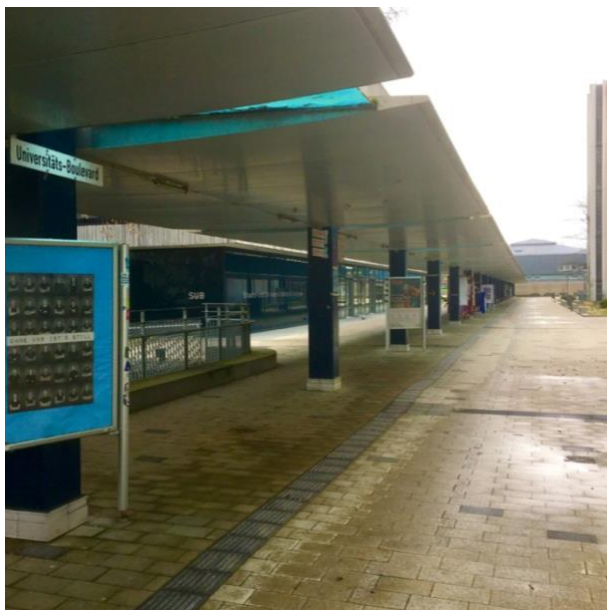
Picture 3: Universitäts-Boulevard facing towards GW2