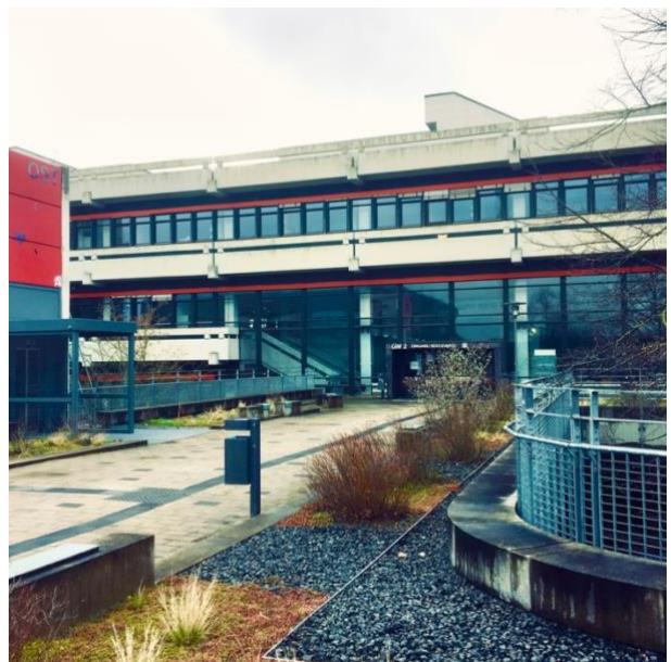
Picture 4: GW2 entrance from Universitäts-Boulevard