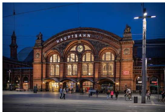
Central Station

Outside central station, take tram number 6 heading towards “Universität” from track E. Take off at the stop “Universität Zentralbereich”. The stop itself is in front of the glass building (see picture above). The conference will take place in building “GW2”. Please see below for further information how to reach GW2.