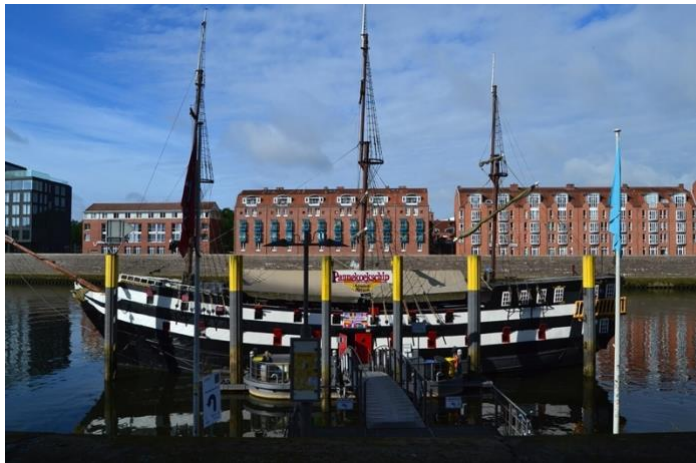
Admiral Nelson

For those of you who will participate in Bremen, we will conclude the day with a conference dinner on ship Admiral Nelson, which is located in the river Weser next to the city center.