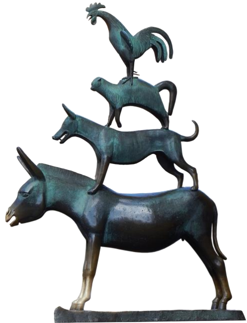
Bremen Town Musicians

(on behalf of the local organizing committee)