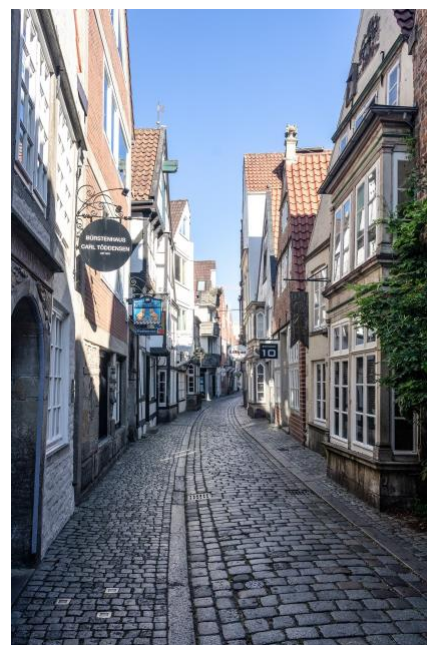
Schnoor © Medienservice, pixabay.com

For any question with respect to the submission of papers, please write an email to submission.mavi27@uni-bremen.de .