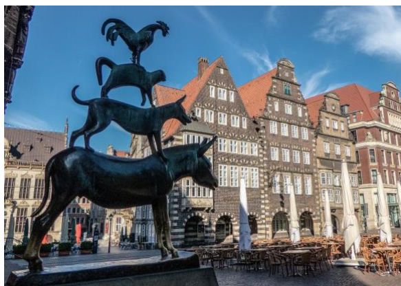
Bremen Town Musicians