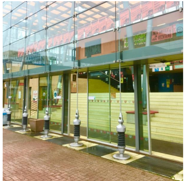
Picture 2: Glass building, two stairs