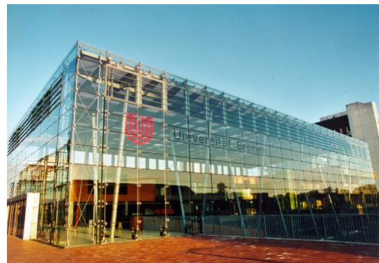
Glass Building

The airport is very well located and only an eleven minutes tram ride from the city center. At the airport, take tram number 6 heading towards “Universität”. Take off at the stop “Universität Zentralbereich”. The stop itself is in front of the glass building (see picture on the right). The conference will take place in building “GW2”. Please see below for further information how to reach GW2.