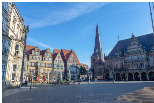
Marktplatz, Town Hall, UNESCO World Heritage

For any question with respect to (pre-)registration to the conference, please write an email to registration.mavi27@uni-bremen.de .