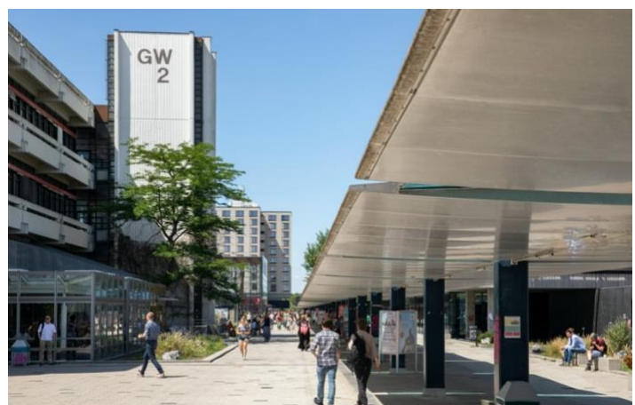
Universitäts-Boulevard in front of GW2 looking in the direction of Universität/Zentralbereich

MAVI27 will take place in building “GW2” in rooms B2880 and B2890. Please enter the building from the upper pedestrian area “Universitäts-Boulevard”.