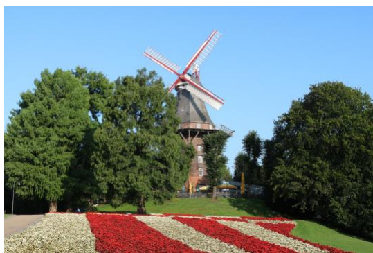
Wind Mill

More information can be found on http://www.hotel-heldt.de/ . Unfortunately, the website is in German only (although they do speak English). If you need assistance to book at Hotel Heldt, we will be happy to help! Please send an email to registration.mavi27@uni-bremen.de .